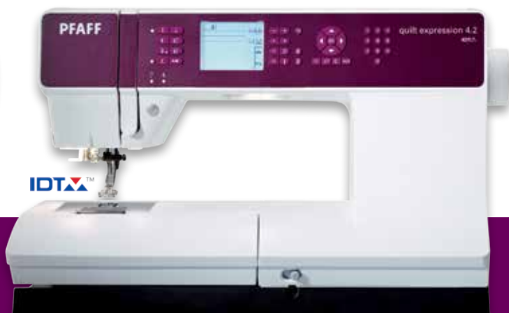
quilt expression™ 4.2