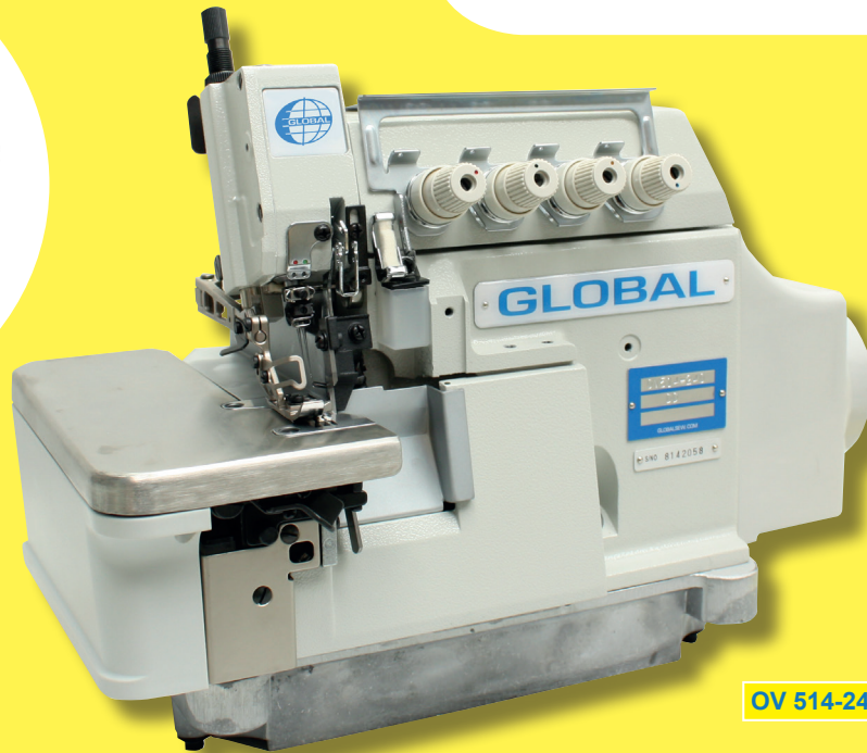
OV 514-240 DD