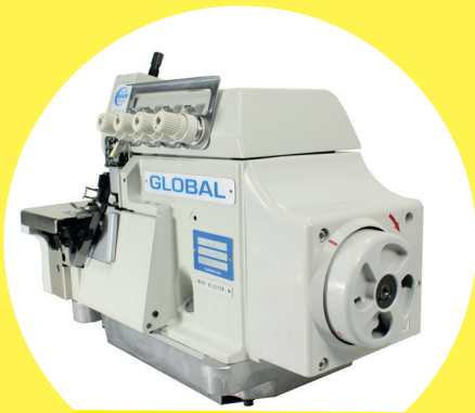
POGONSKI MOTOR UGRAĐEN U GLAVU MAŠINE